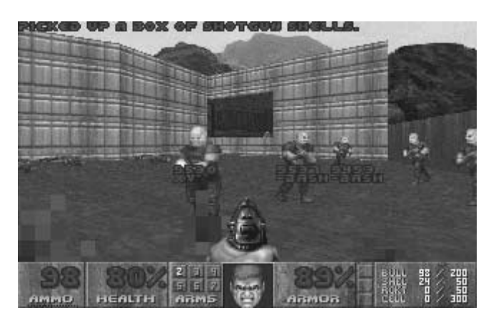
Figure 1: The PSDoom interface.

SIGCHI'01 , March 31-April 4, 2001, Seattle, WA, USA.