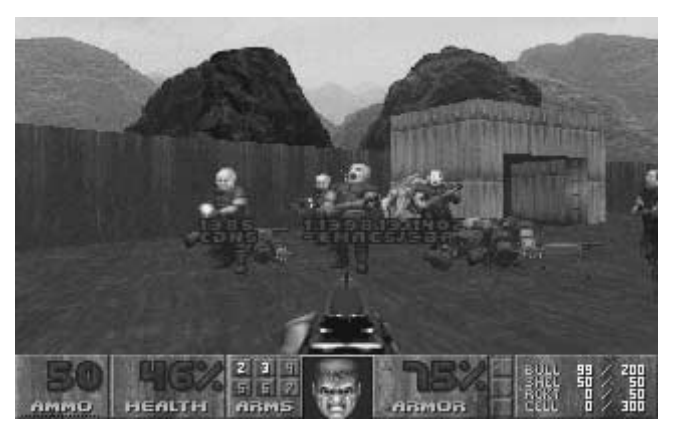
Figure 3: Killing a process in PSDoom.

A significant problem with the current implementation of PS-