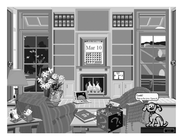
Figure 5: Microsoft Bob.

sentation and artistic expression [6]. The idioms of cartoons form an effective vocabulary for concise visual communication with the user, but cartoons lack a crucial element of user interfaces: interactivity. Computer games have successfully integrated concise, stylized visual representations and feedback from the user.