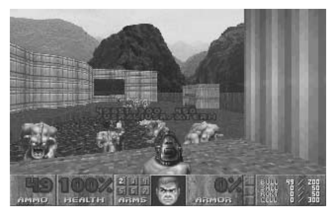
Figure 2: The view from the balcony in PSDoom.

sters and the user's limited ammunition are disincentives to attack them. Conflict among process monsters could help regulate heavily-utilized systems by making crowded rooms have higher mortality rates. Killing random processes on an extremely loaded system is not an uncommon operating system strategy. When the user is "killed," he or she will be healed and placed at the entrance of the dungeon with a pistol and a modest amount of ammunition.