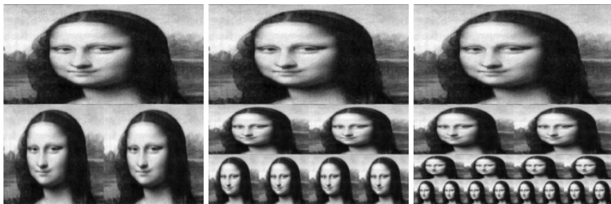
Figure 3: Bottom splits with n = 1, 2, and 3.