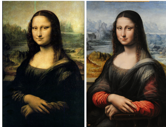
Figure 1: The Louvre Mona Lisa (left) and the Prado Mona Lisa (right).

stands for hue , S for saturation , and I for intensity . We will study color at length later in the semester, for now, it suffices to know that a color image can be decomposed into its HSI component images using the function color-image \rightarrow hsi , and that HSI component images can be used to construct a color image using the function hsi \rightarrow color-image .